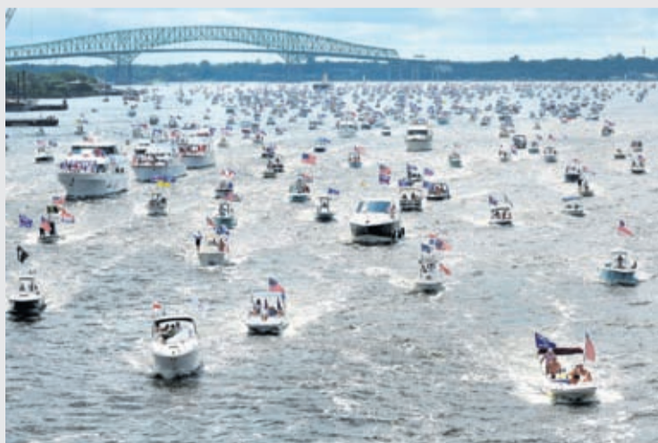
Hundreds of boats idle through downtown on the St. Johns River during a rally Sunday, June 14, 2020, in Jacksonville, Fla., celebrating President Donald Trump's birthday.

In Palm Beach County — home of President Donald Trump's Mar-a-Lago resort — separate caravans of trucks, motorcycles and boats were riding along highways and the inter-coastal waterway at various times in the morning. The organizers were part of the president's Florida re-